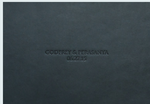
Debossing - two lines

Prints, magical prints, start at $8 for fine art quality