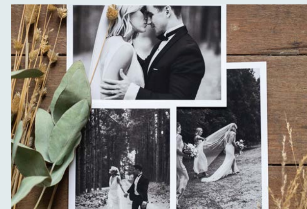
Fine Art Prints