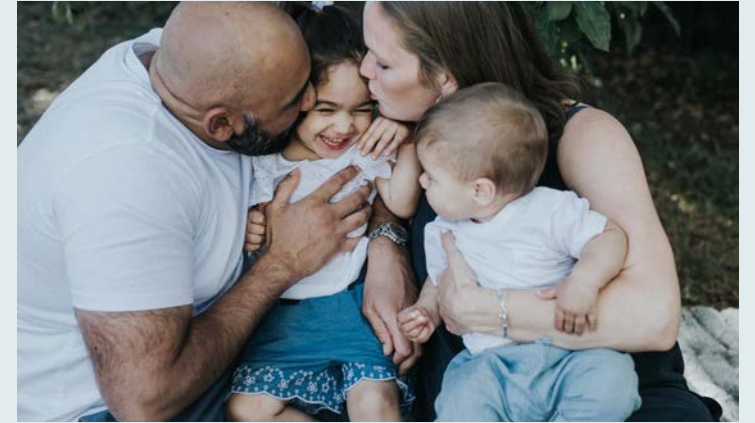
KHAN FAMILY | Hobart, Tasmania Click here to view