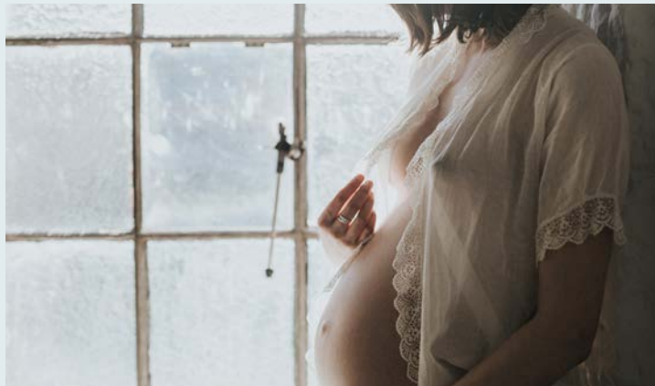
SKYE | Pregnancy Portraits Click here to view